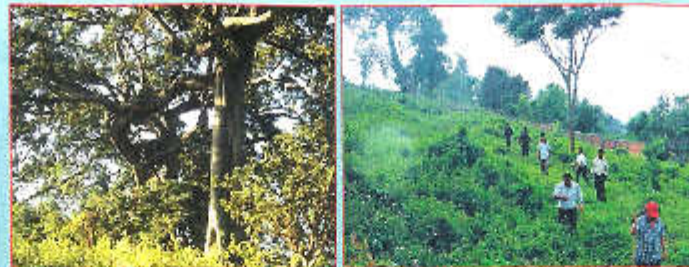
World Environment Day, 5 June, 2015: "One World, One Environment"