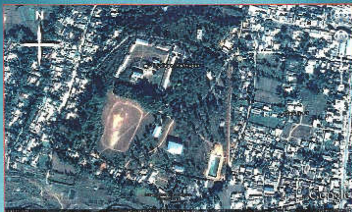
COLLEGE CAMPUS = 27.5 acres