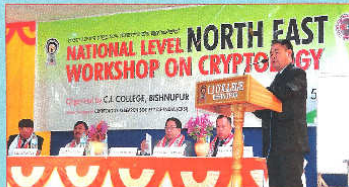
Academic Performance of the College