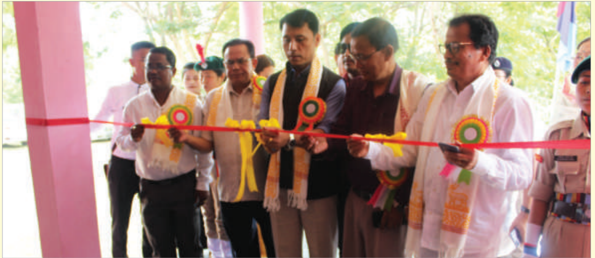
Inaugural Function of New Classrooms